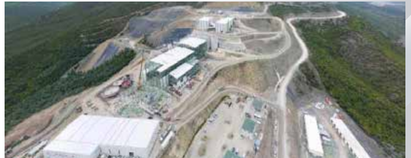
Acacia Mining Hangar Before Installation | After Installation