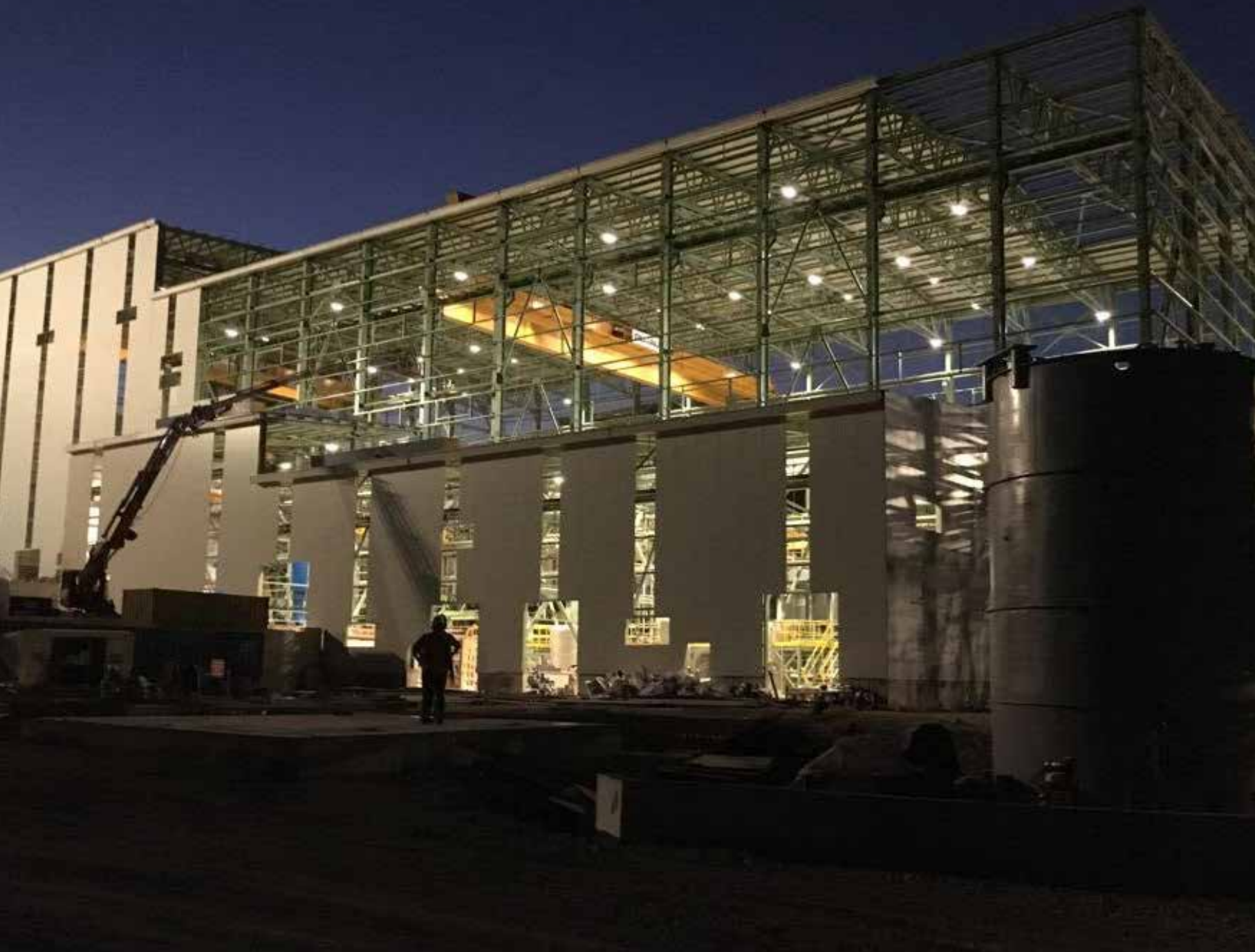
ACACIA Mining Factory Hangar Project -Türkiye